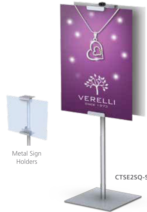
Metal Sign Holders

Three Common Base and Two Color Choices >