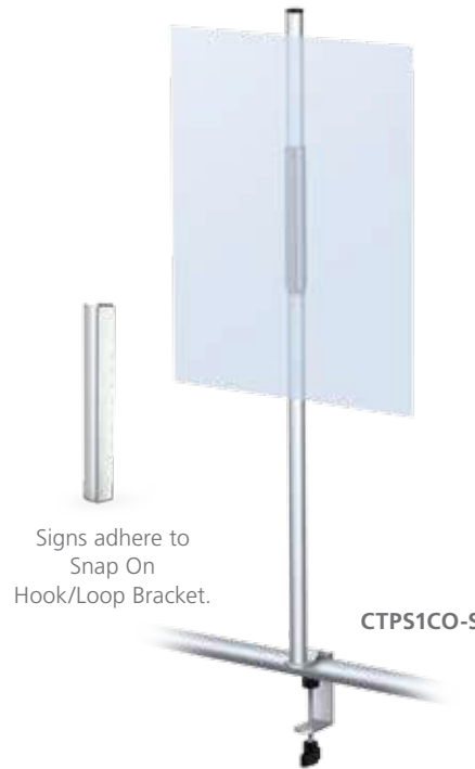
Signs adhere to Snap On Hook/Loop Bracket.