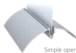
Simple open & close design 3-1/4" deep, 1" high.