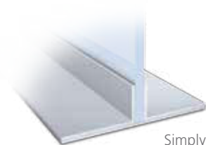
Simply insert graphic 4" deep, 1" high.