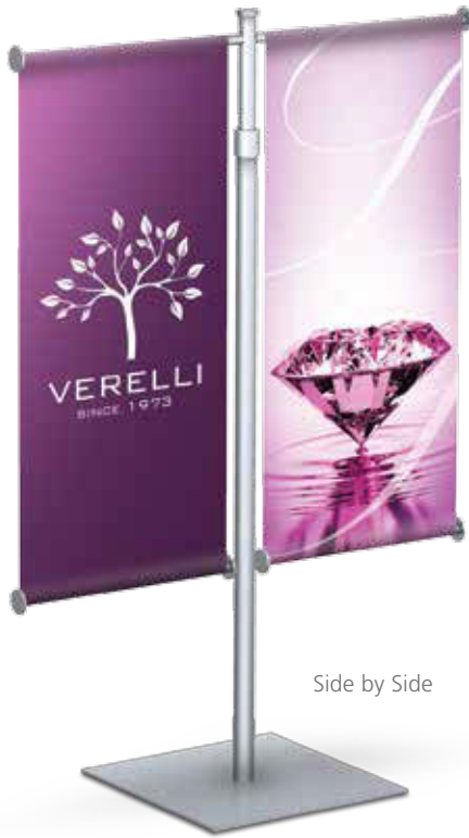
Side by Side