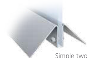
Simple two screw connection 3-3/4" deep, 1-5/8" high.