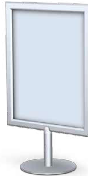
Table Top Round Base

6-3/4" round base, 4" riser. Top entry slot.