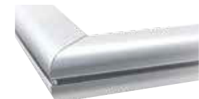
Curvilinear Satin Silver