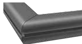
Curvilinear Matte Black